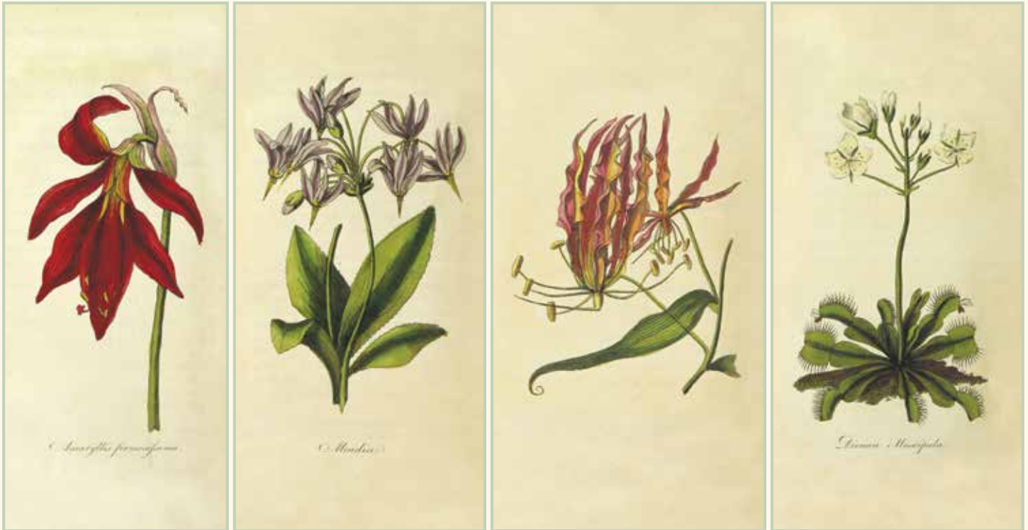
Plates from Erasmus Darwin's The Botanic Garden .