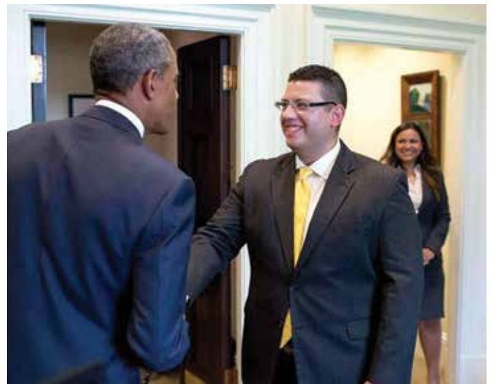
Scott Astrada was an attorney for the Obama administration from 2013–14.

It is not just what we read, but how we read that matters to Scott. Reflective reading also exposes how our